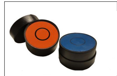
Magnetic Susceptibility Calibration Pads