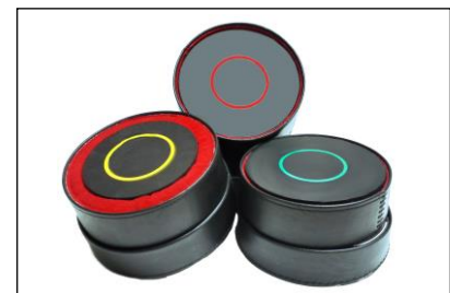
Conductivity Reference Pads