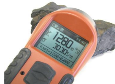
KT-10 S/C (Circular Coil)