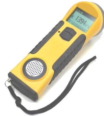
KT-10 v2 Magnetic Susceptibility Meter (Circular Coil)