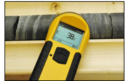
KT-10 Plus v2