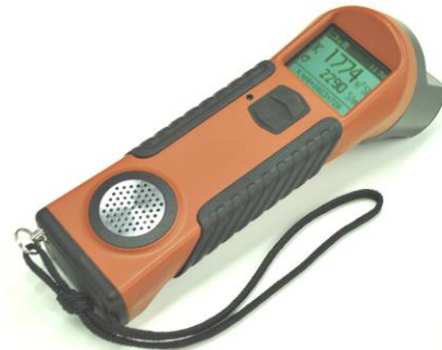
KT-10 S/C Magnetic Susceptibility/Conductivity Meter (Rectangular Coil)